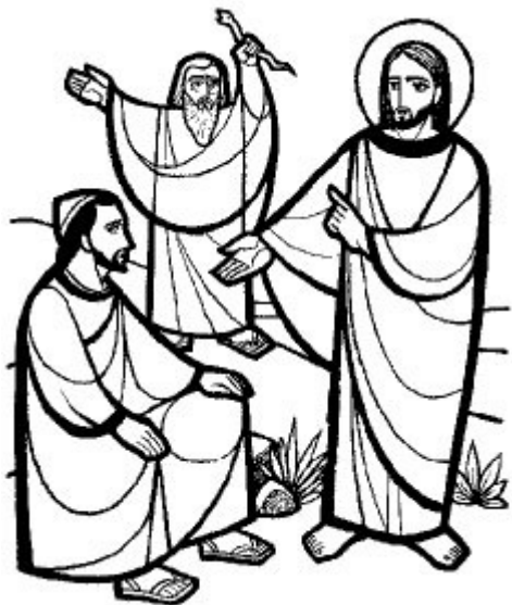
Christ, the Redeemer

"God sent his Son so that through him the world might be saved." We can become so familiar with a sentence like this that we miss the profound truth in it of how much God loves us and longs for us. We think of faith as meaning our belief in God. It is much more about God's intense belief in us and in our goodness and beauty and he wants us to come to a knowledge of that too. We have a serious responsibility to one another of constantly bringing that knowledge to each person in every way we can. One of the major tasks for every married couple is to help each other to know how much they are loved and treasured. This is done through affirmation and affection. Parents have this same responsibility towards their children. They can help each one be a truly successful human being by building up their goodness. And in the parish community we help one another by looking out for each other.